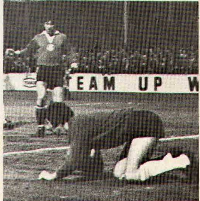
An incident during the Swindon v Burnley match.

Our Youth team was beaten 1-0 by Ipswich in the quarter-final of the F.A. Youth competition; a good effort by our lads to reach that far, although we did not play at all well in this game. Ipswich scored the only goal in the last minutes of the game.